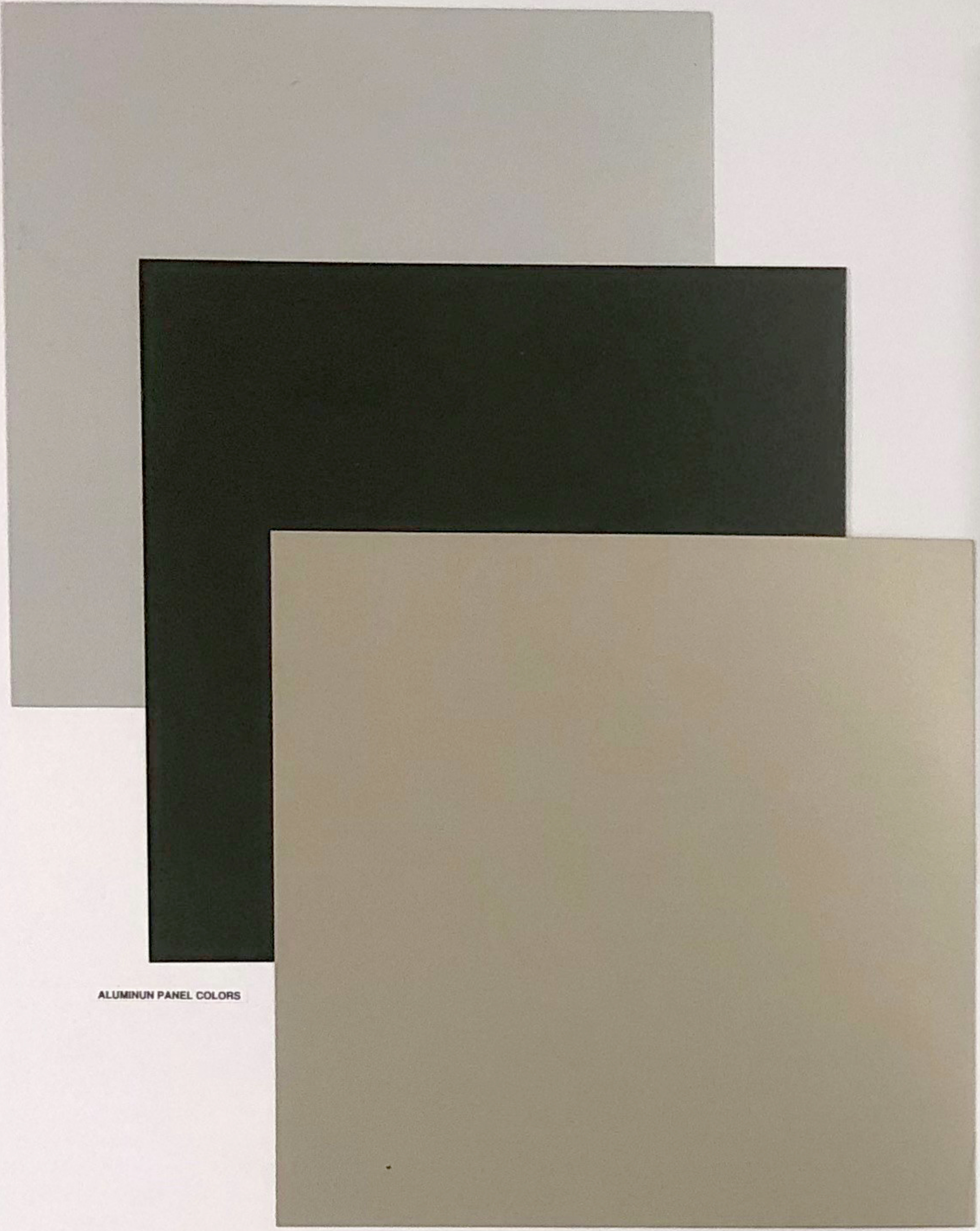
ALUMINUM PANEL COLORS