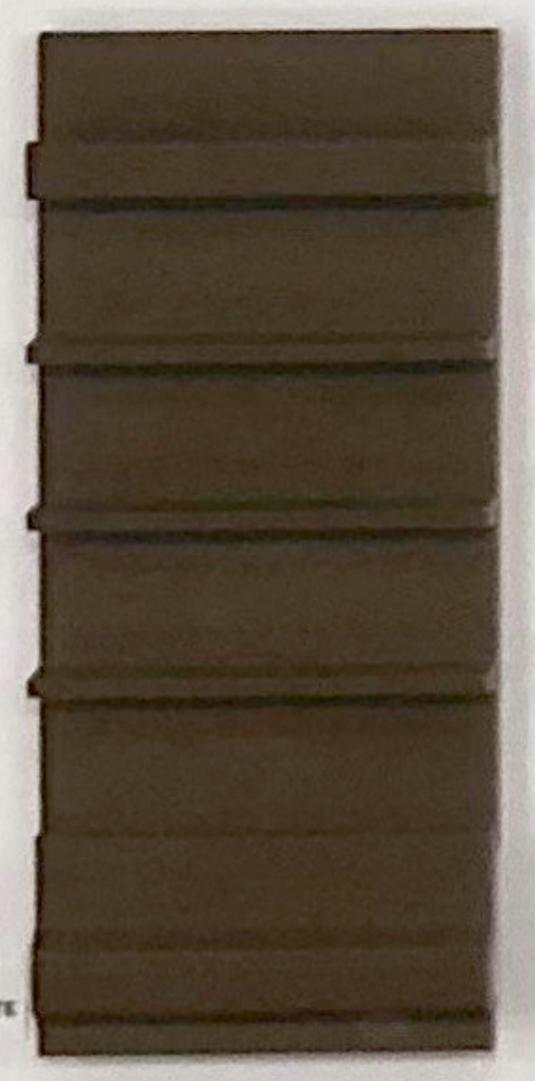
SIDING CLADDING COMPOSITE W/ WOOD SUBSTITUTE (MEXYSTA)