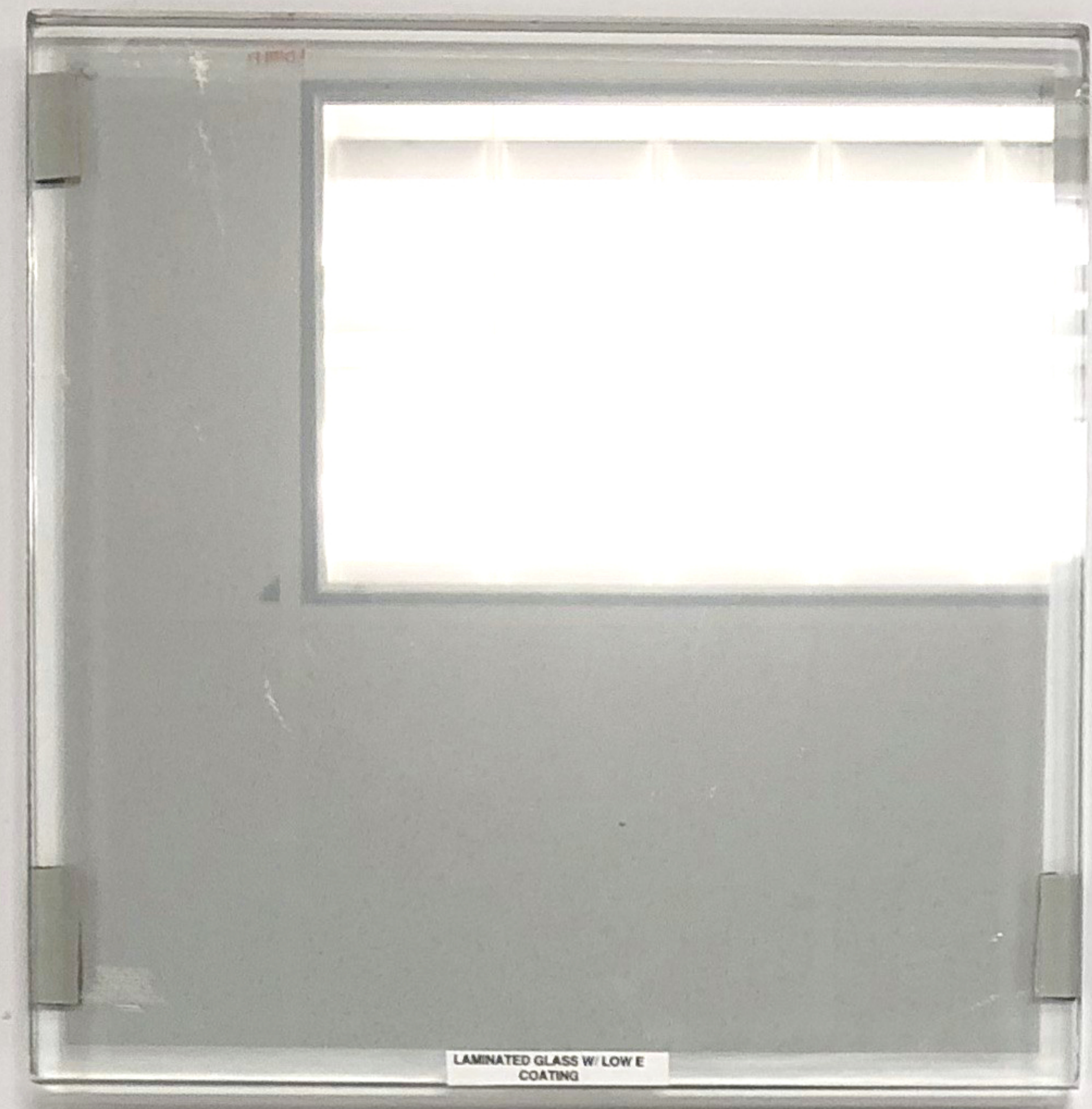
LAMINATED GLASS W/ LOW E COATING