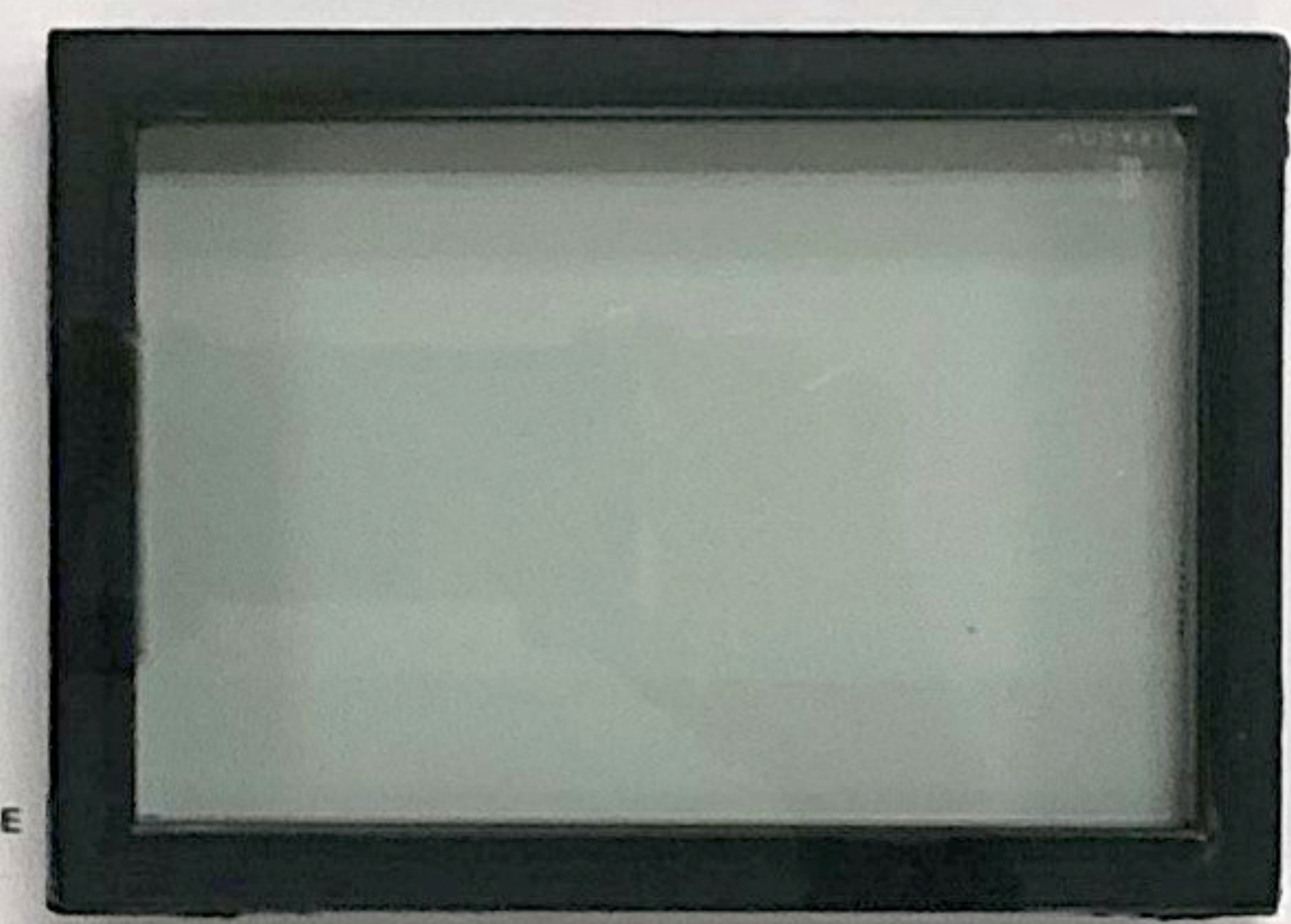
INSULATED GLASS WITH LOW -E COATING