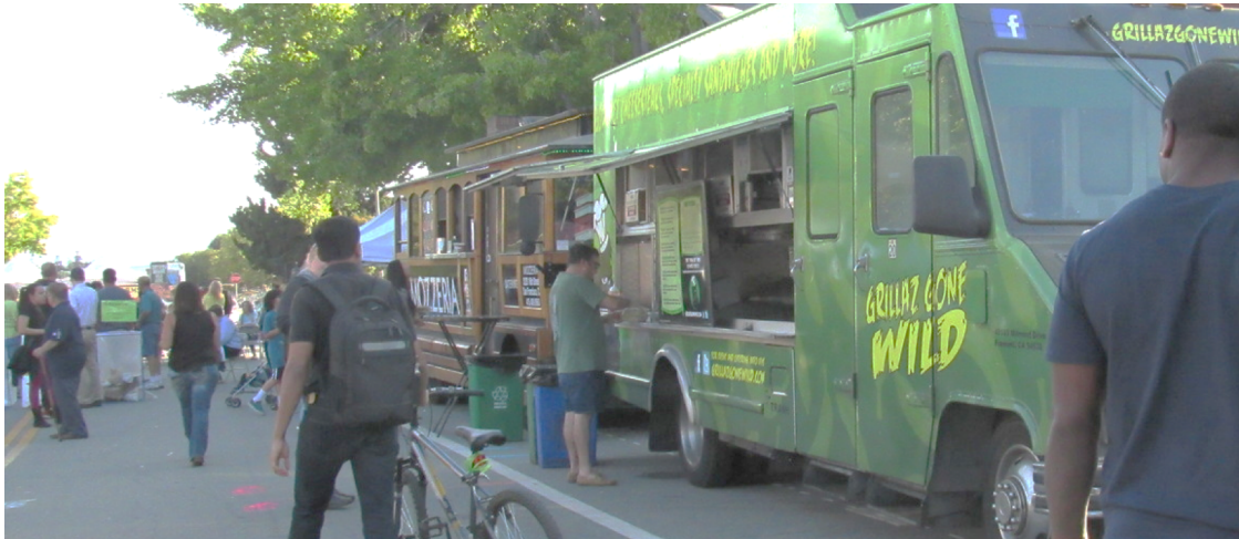
Fremont Street Eats

Beginning in 2013, the City of Fremont began working with the Fremont Chamber of Commerce to establish a weekly food truck event in Downtown Fremont. Fremont Street Eats is now a weekly event in its third season, sponsored by the Chamber. Street Eats was intended as an economic development program intended to help activate the Downtown. Many existing businesses, including small retailers and restaurants, consider the program a successful economic development effort because it helps bring pedestrian traffic to an area that was historically underused.