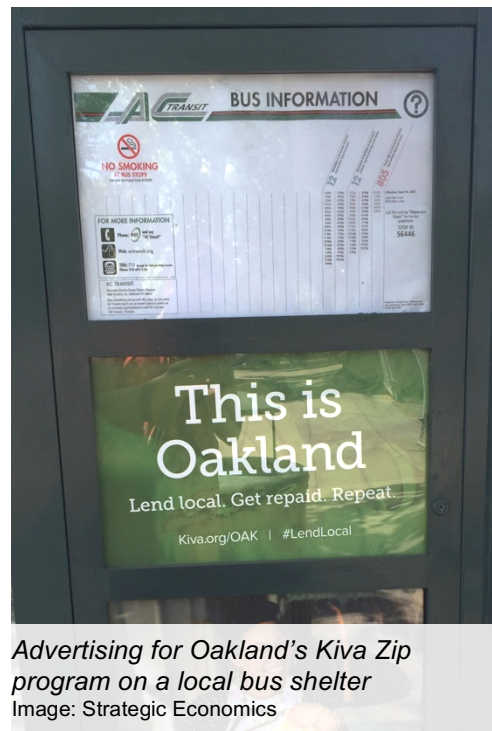
Advertising for Oakland's Kiva Zip program on a local bus shelter

Kiva Zip is a microfinancing platform that connects entrepreneurial borrowers with individuals interested in supporting small businesses in the U.S. A Kiva Zip “trustee,” which can be an entire organization, recommends borrowers for a loan based on the borrower’s qualifications and local knowledge. The trustee can support borrowers in other ways but does not have any fiduciary responsibility for the loan. Trustees take on no direct financial risks, but their reputation is based on the repayment of the loans that they endorse. In 2013, the City of Oakland became the first city government to serve as a Kiva Zip trustee. Since that time, the City has endorsed 33 loans for a total value of approximately $235,000, and a repayment rate of 87 percent. The City uses billboard advertising to promote the program, which supports locally owned businesses, often in food service.