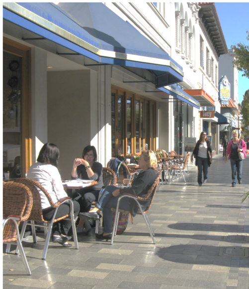
Downtown Burlingame