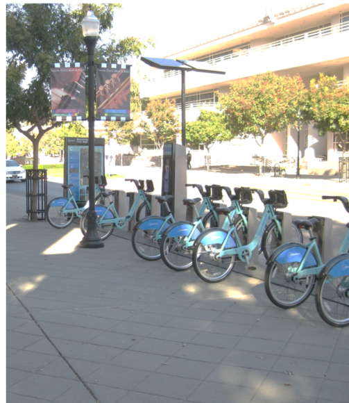
Downtown Mountain View Image: Strategic Economics