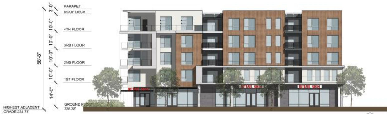
2 ALVES DR. ELEVATION 1/8" = 1'-0"