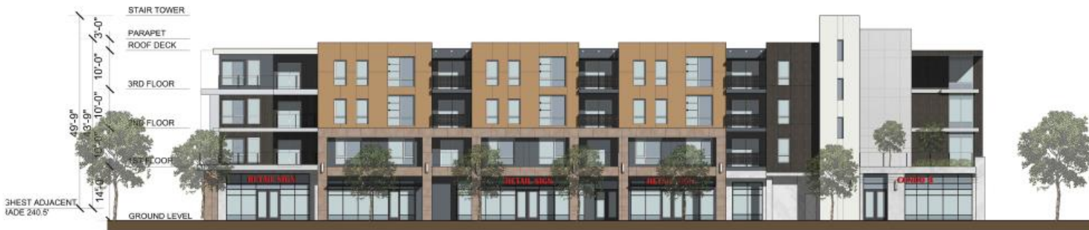
2 PASEO ELEVATION 1/8" = 1'-0"