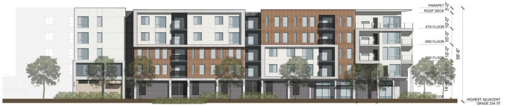
1 DE ANZA ELEVATION 1/8" = 1'-0"