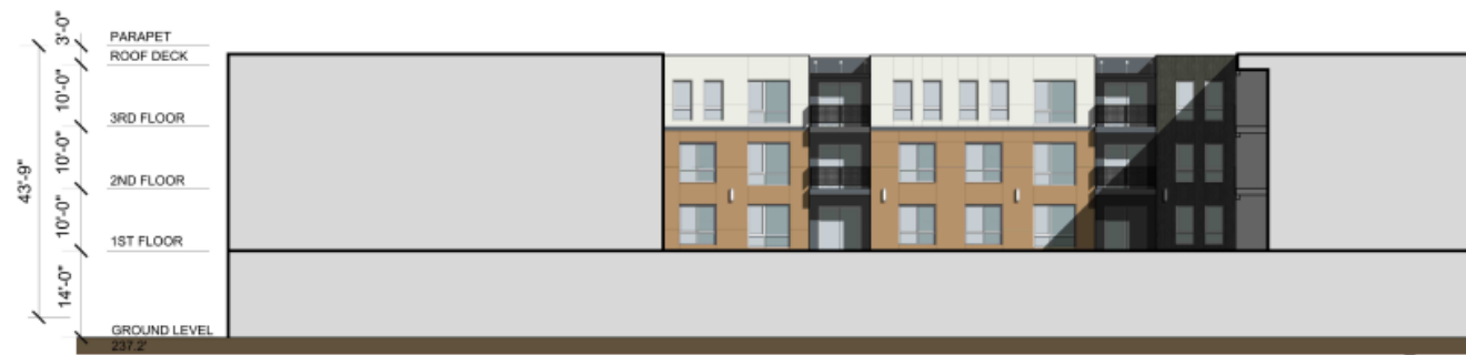
3 COURTYARD ELEVATION 1/8" = 1'-0"