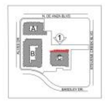
1 ELEVATION 1/8" = 1'-0"