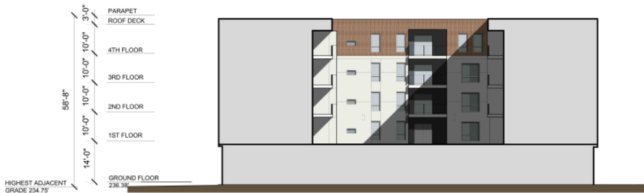
2 COURTYARD ELEVATION 1/8" = 1'-0"