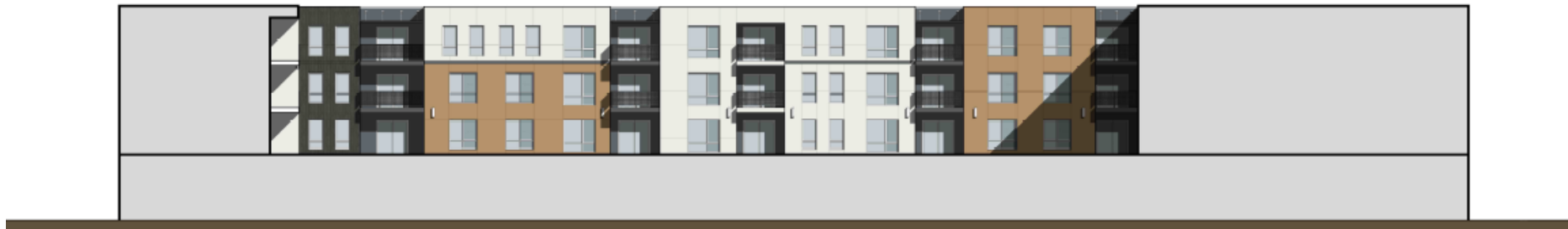
1 COURTYARD ELEVATION 1/8" = 1'-0"