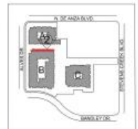
BUILDING B ELEVATIONS SCALE: 1/8" = 1'