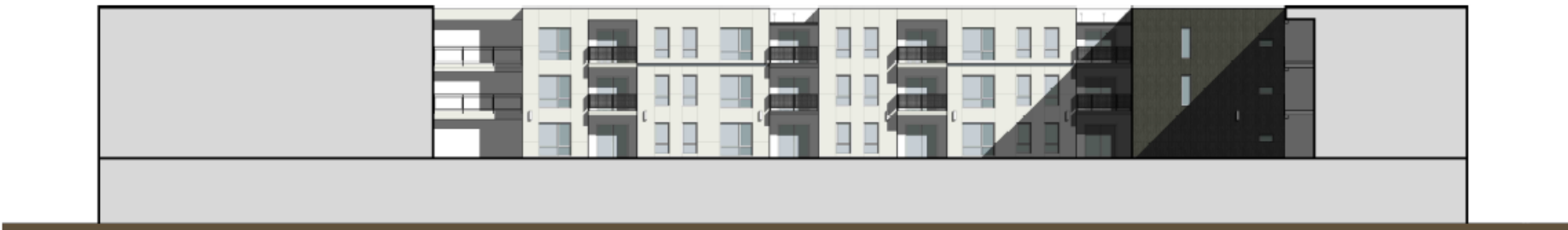
2 COURTYARD ELEVATION 1/8" = 1'-0"