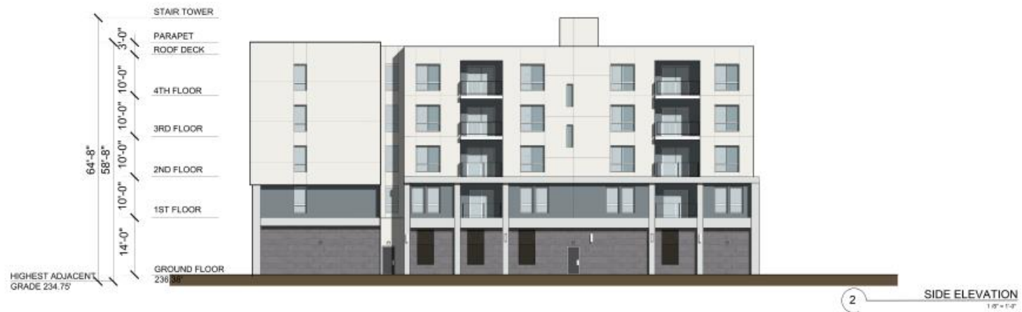
2 SIDE ELEVATION 1/8" = 1'-0"