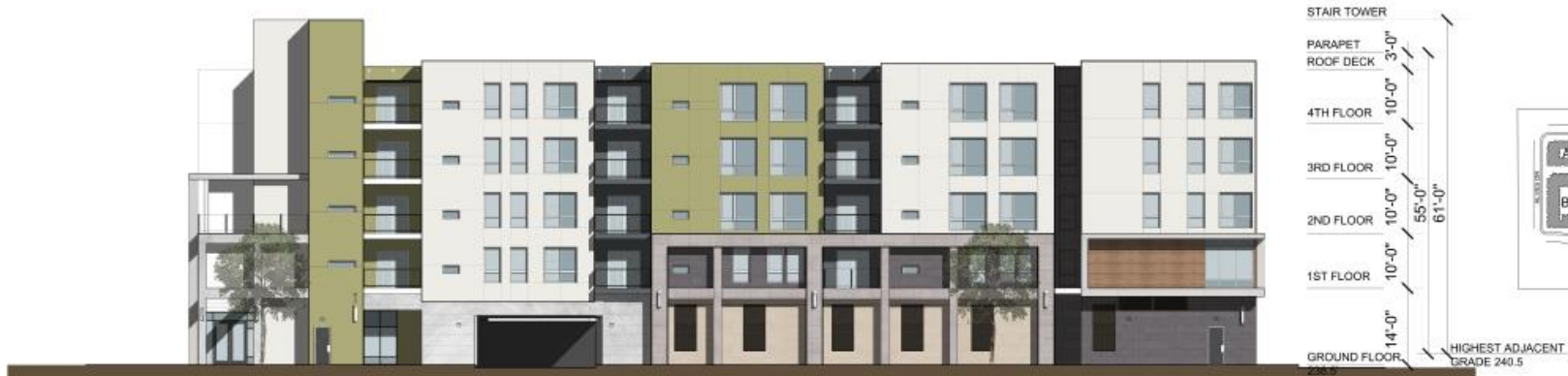
1 BANDLEY ELEVATION 1/8" = 1'-0"