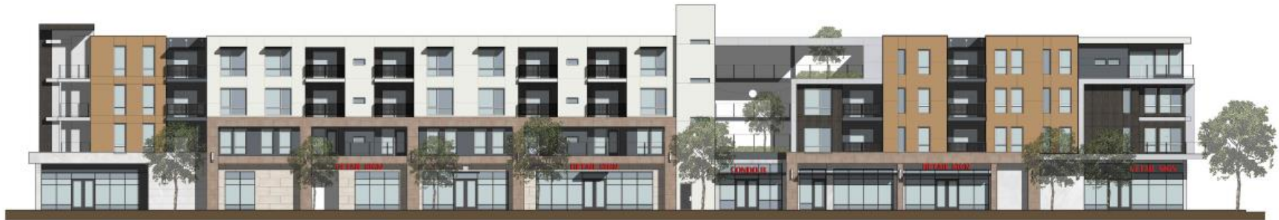
1 STREET ELEVATION 1/8" = 1'-0"