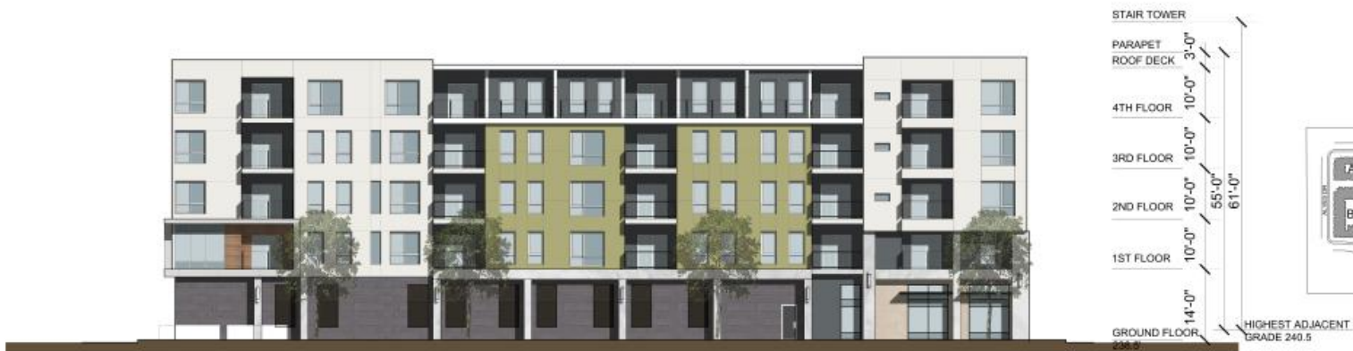
2 ELEVATION 1/8" = 1'-0"