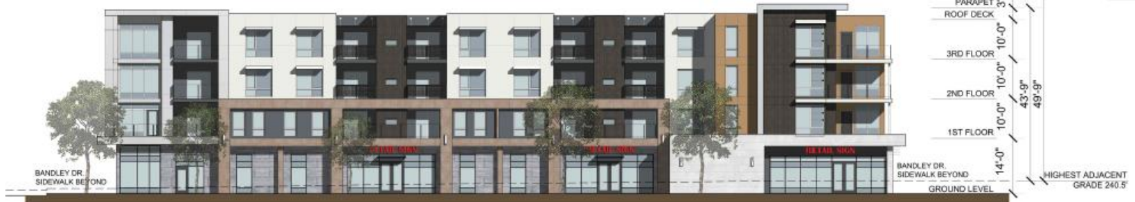
2 BANDLEY ELEVATION 1/8" = 1'-0"