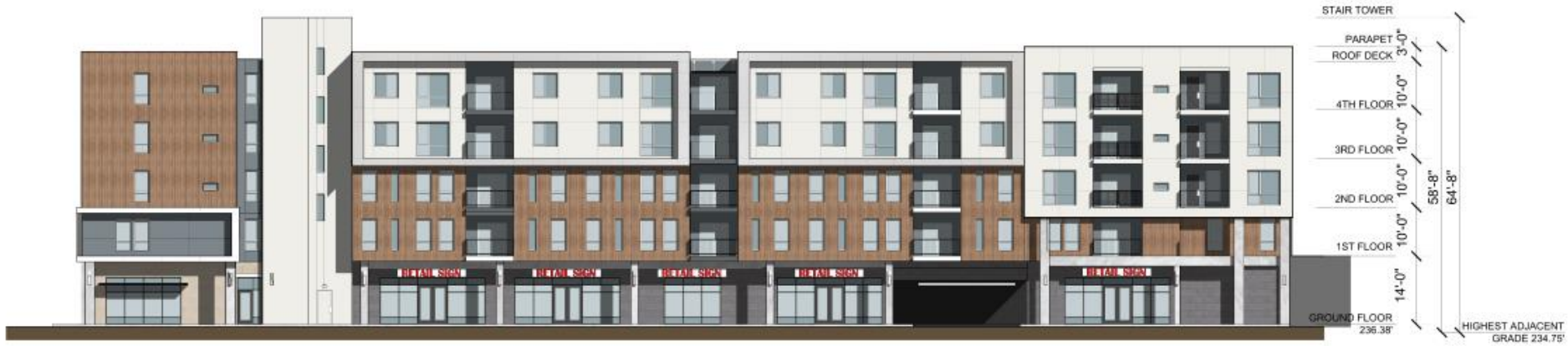
1 PASEO ELEVATION 1/8" = 1'-0"