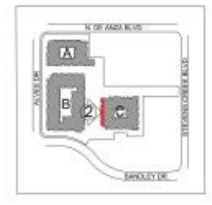
2 ELEVATION 1/8" = 1'-0"