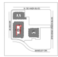
BUILDING B COURTYARD ELEVATIONS SCALE: 1/8" = 1'