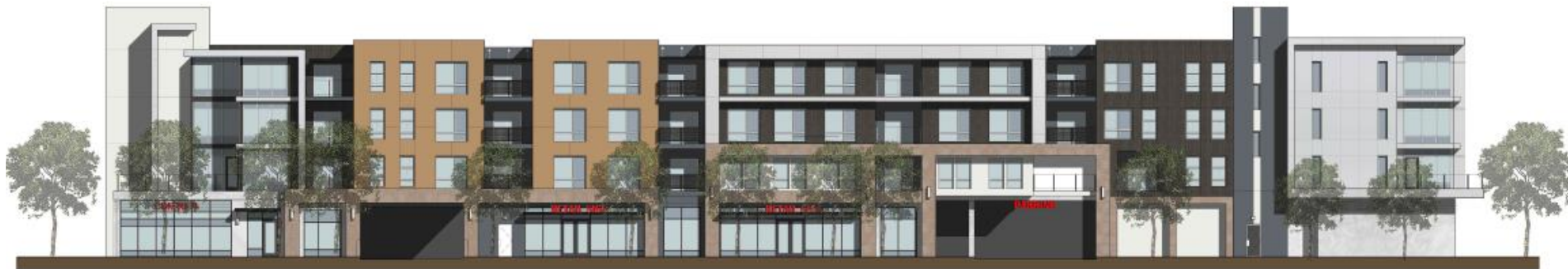
1 ALVES DR. ELEVATION 1/8" = 1'-0"