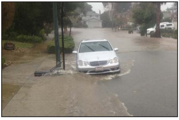
Flooded streets make it hard for cars, pedestrians, bikes, and emergency vehicles to navigate.

The City of Cupertino recently completed a comprehensive Storm Drain Master Plan (led by Schaaf and Wheeler Civil Engineers) which determined the appropriate service levels for operations and maintenance for the City's storm drainage system, and it identified several high priority system deficiencies, including undersized pipes. As a result, the City of Cupertino is considering proposing a funding measure to help pay for these critical infrastructure needs, and seeks input from local property owners on your priorities for local flood protection and clean water projects. Please read the following information, then complete the enclosed survey and mail it back in the postage paid envelope as soon as possible. Your answers will help guide our efforts toward protecting the City and its residents from local flooding and protecting water quality.