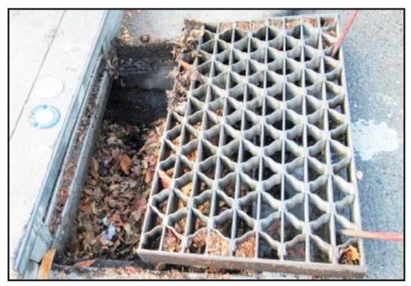
City workers prevent flooding by cleaning leaves and other debris from catch basins before the rain starts.

When a storm is forecast, a team of City engineers and maintenance staff proactively clean drains and perform other preventative maintenance before the rain starts. Once the storm arrives, this team patrols known problem areas, making sure inlets and catch basins are clear, and taking other action as necessary to prevent flooding. They also respond to calls from the public as needed.