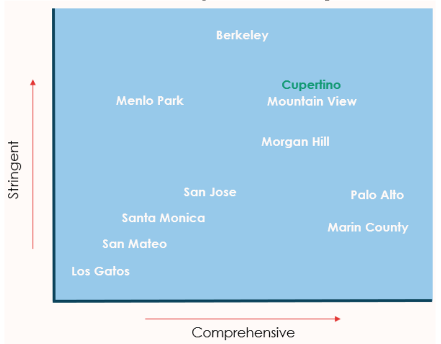
Local Green Building Ordinances Comparison

As part of public outreach and study, Cupertino's consultant prepared a comparison table of the existing green building ordinance with other agencies in California that have a comparable local green building ordinance. The study compared local green building ordinances in terms of both stringency and applicability which is summarized in the following tables. For example, Palo Alto requires new construction to be built to CALGreen Tier 2 standards, which is very comprehensive but only requires energy efficiency, not electrification. On the other hand, Menlo Park requires all-electric and solar, which is stringent but not comprehensive in terms of the sustainability measures or level of verification.