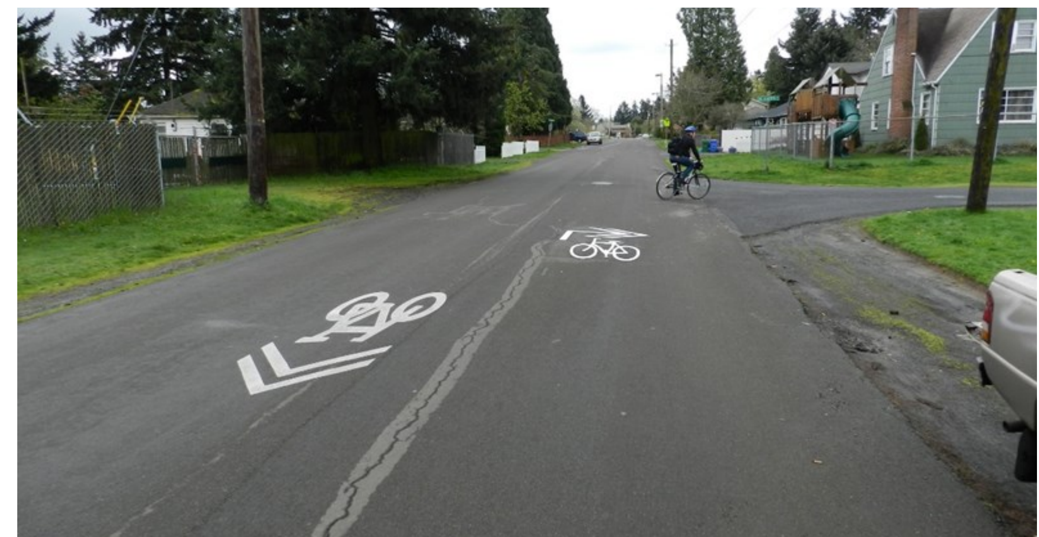
WAYFINDING SIGNAGE & STRIPING