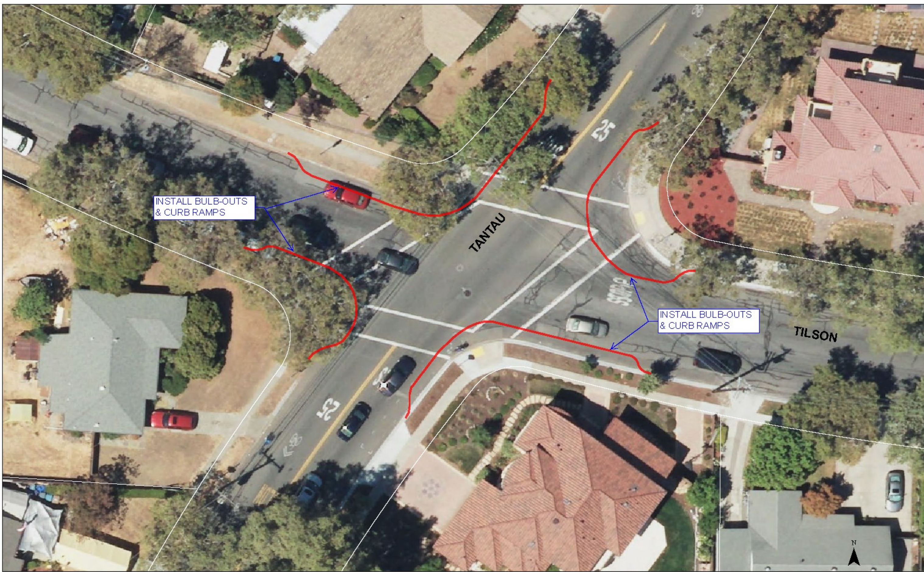
1 | TILSON AVE - S TANTAU AVE