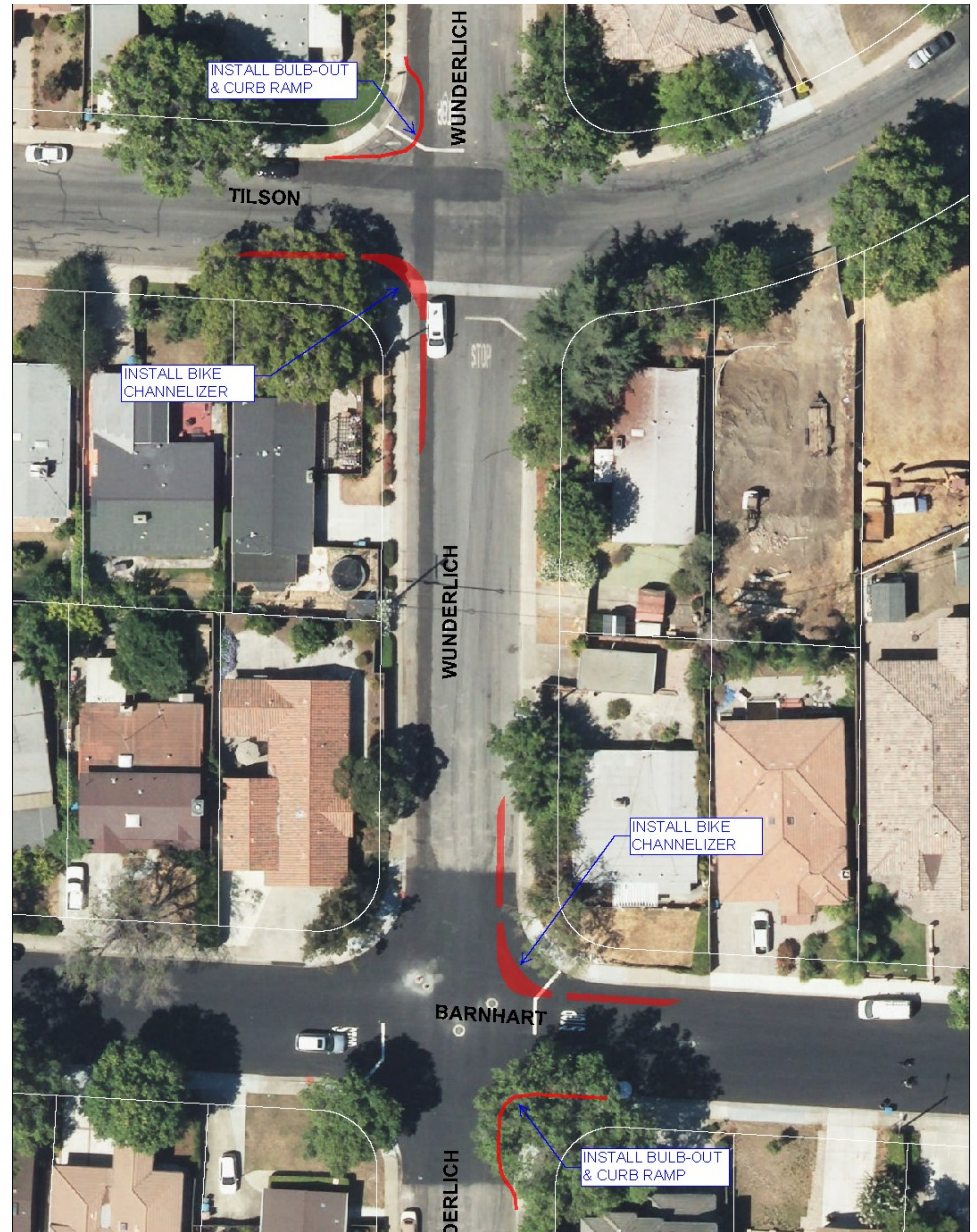
3 | WUNDERLICH DR BTWN TILSON AVE & BARNHART AVE