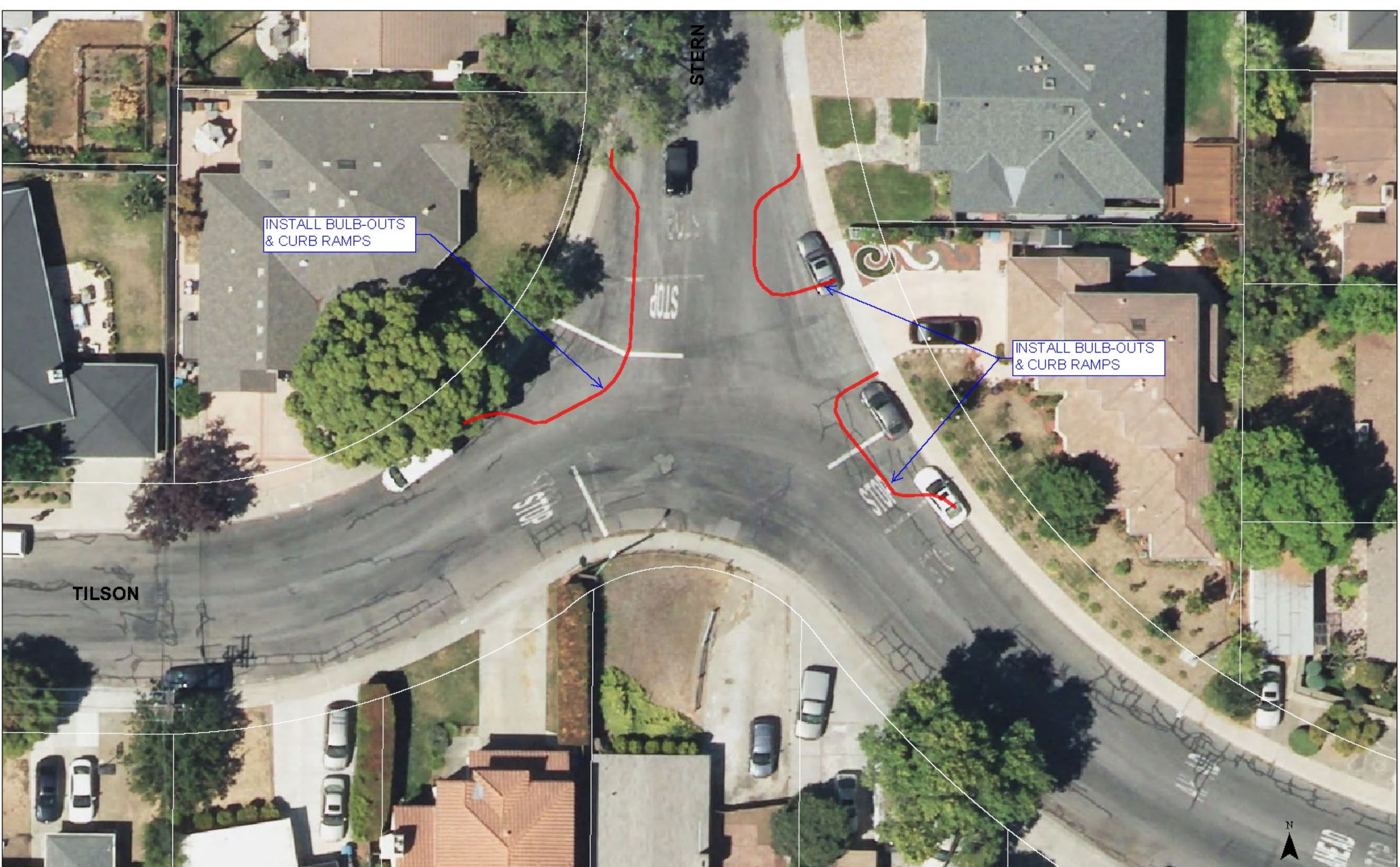
2 | TILSON AVE - STERN DR