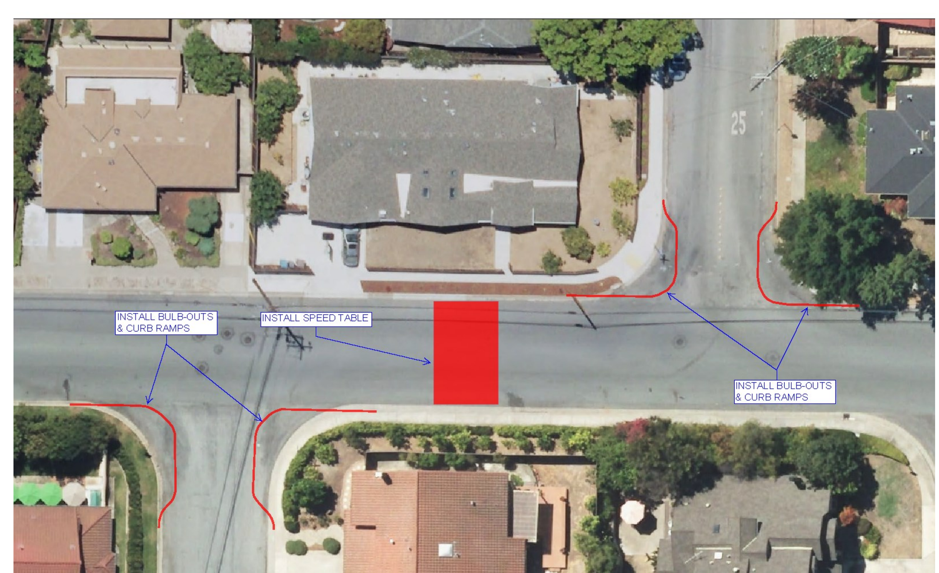
2 | BEARDON DR - GREENLEAF DR