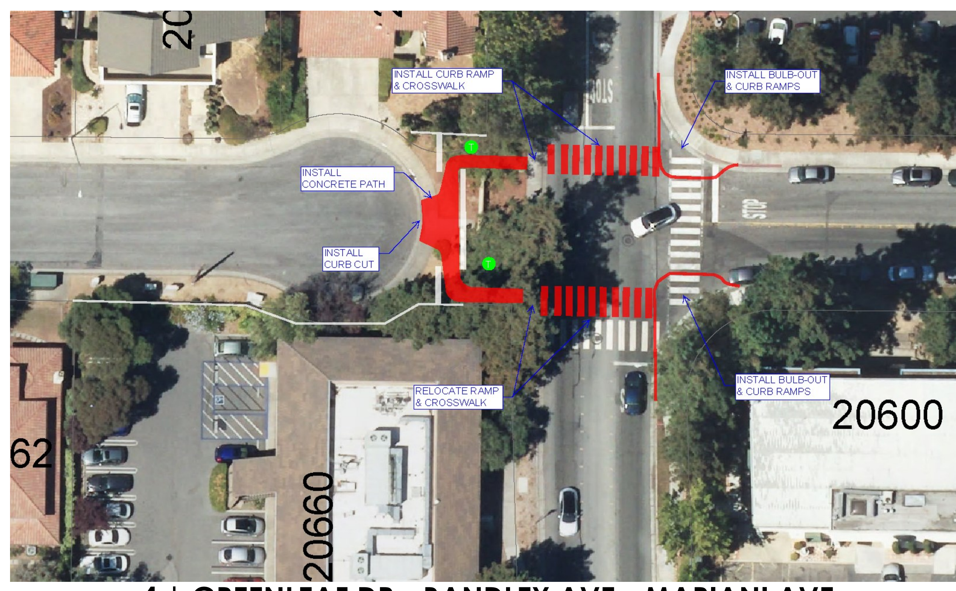
4 | GREENLEAF DR - BANDLEY AVE - MARIANI AVE