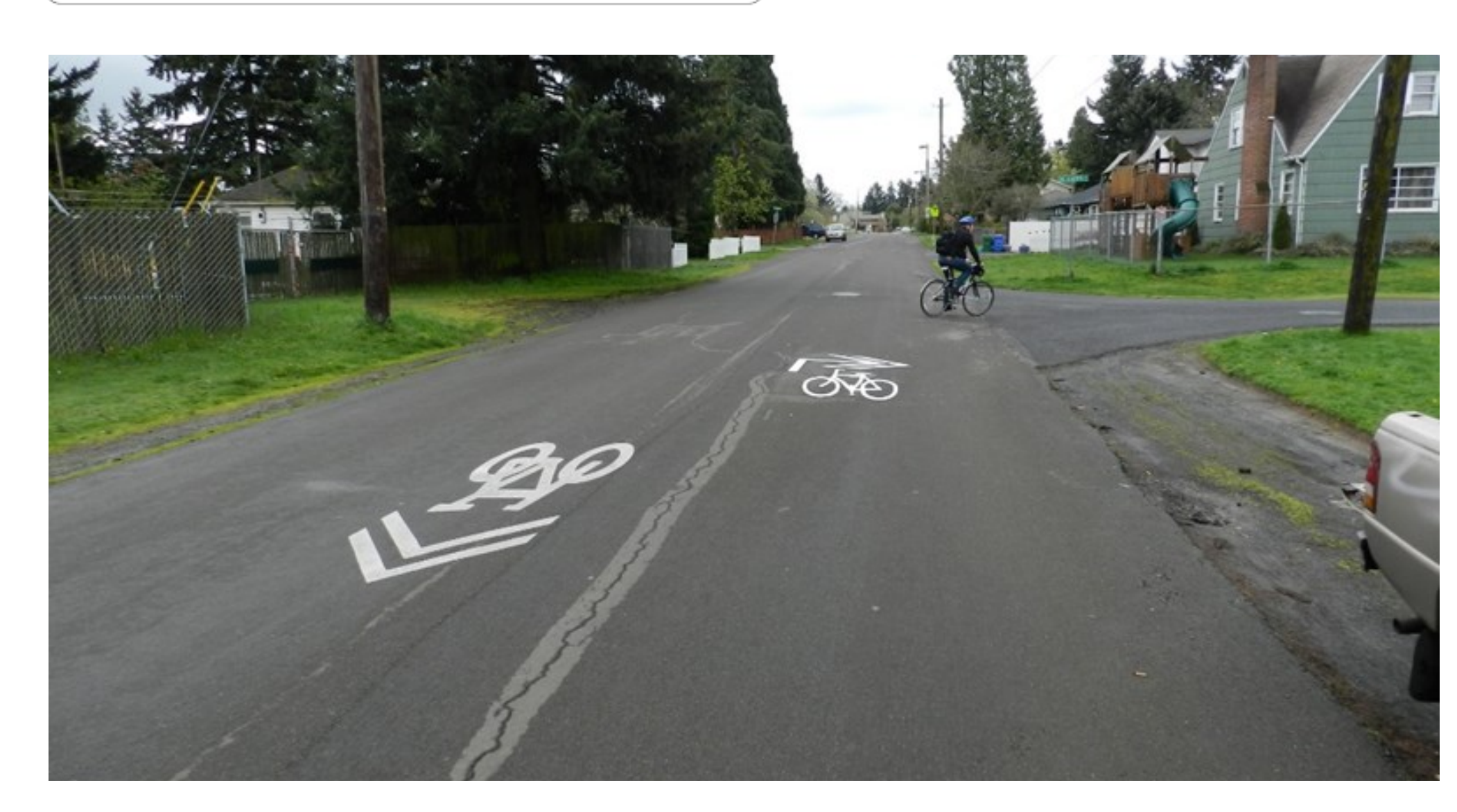
WAYFINDING SIGNAGE & STRIPING