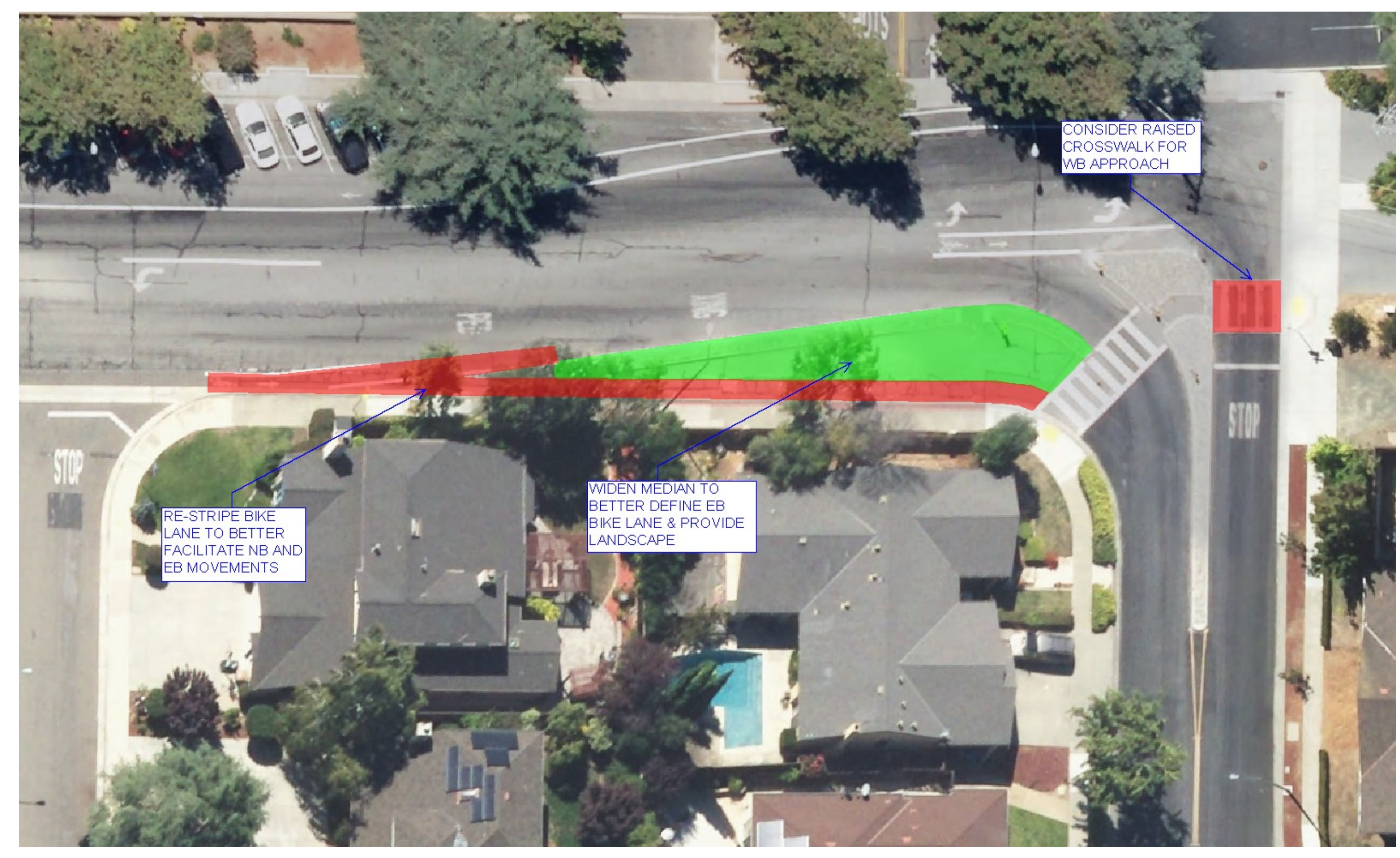
1 | MARY AVE - METEOR DR