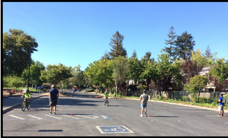
Socially distant Middle School Bike Skills Workshop