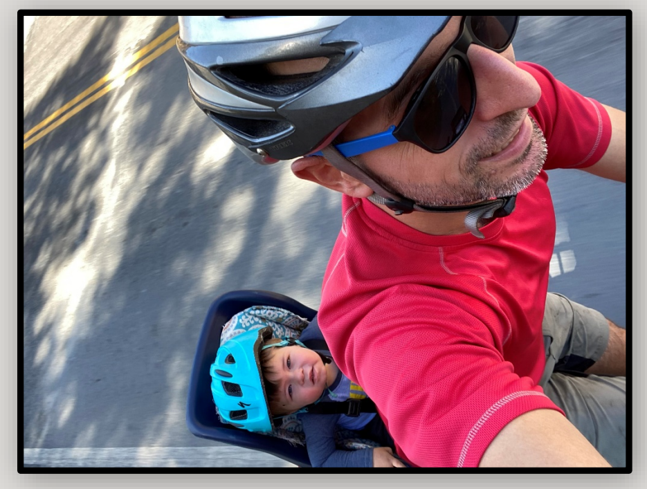
Bike to the Parks