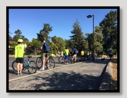
Socially Distant Middle School Bike Skills Workshop