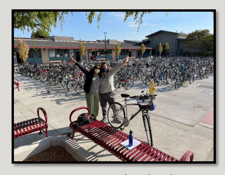
Cupertino High School's New Bike Racks