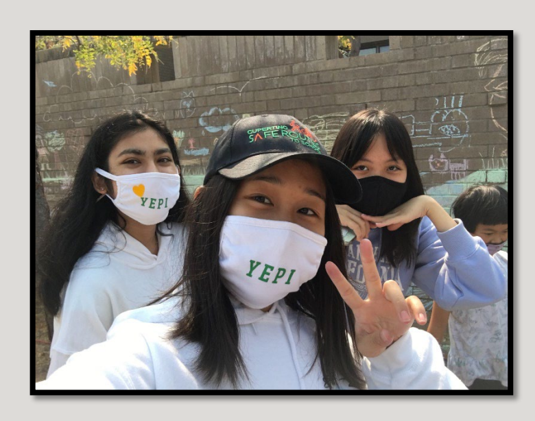
Fall Bike Fest