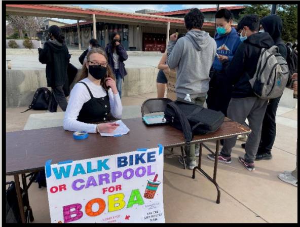
Cupertino High School: Bike for Boba