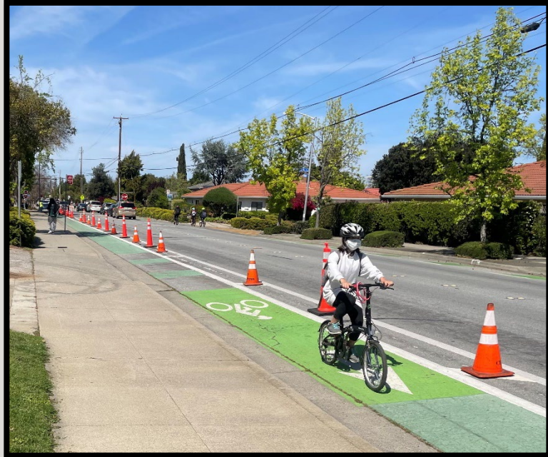
Kennedy Pop-Up Separated Bikeway Pilot