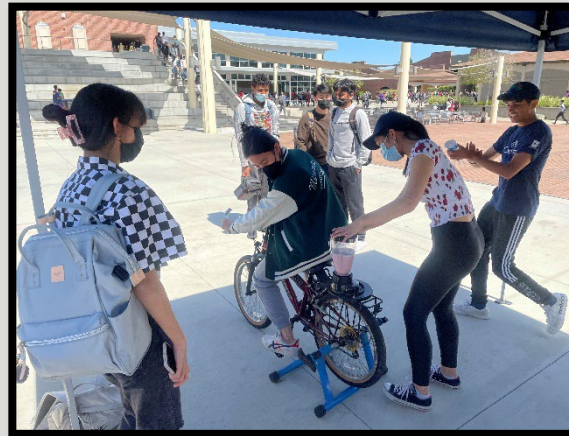
Monta Vista High School: Lunchtime Bike Event