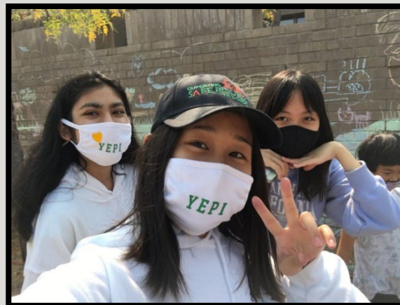
Fall Bike Fest