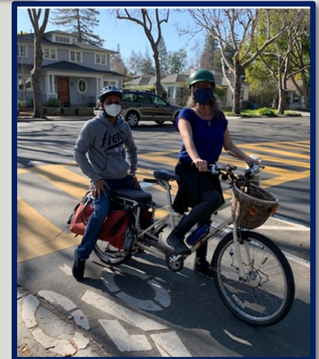
Greene Middle School Bikeway Tour