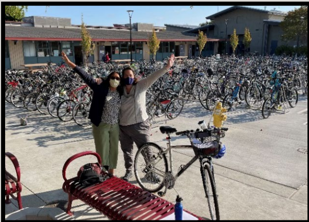
Cupertino High School's New Bike Racks