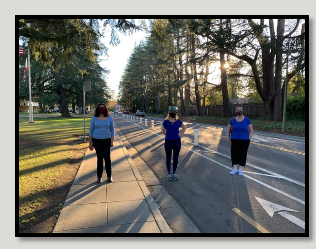
Checking out two-way separated bikeway in Palo Alto