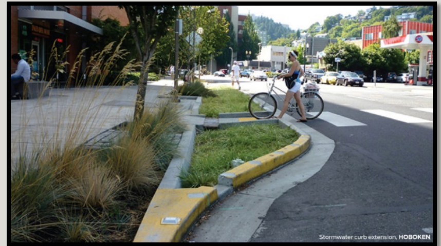
Hoboken curb extension

Finch & Calle de Barcelona (image not representative of Cupertino design)