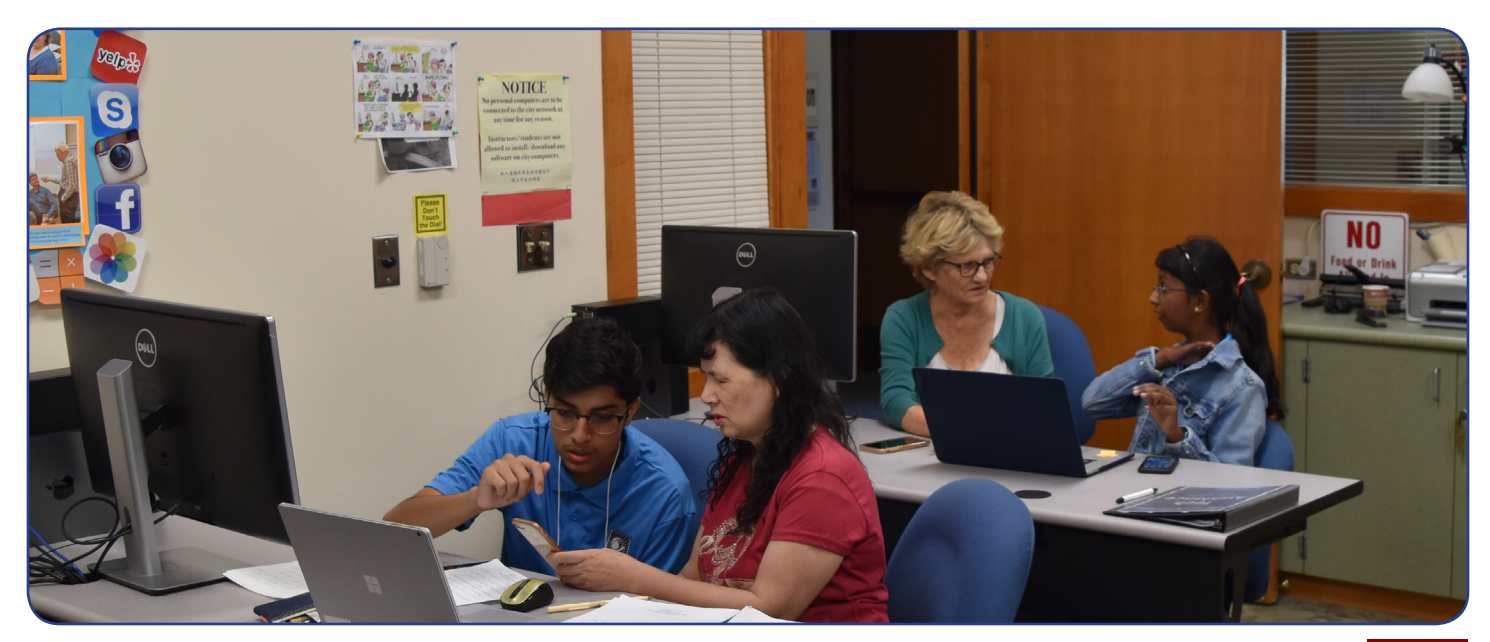
Tuesday, 4 - 6:30 p.m., Saturday 10 a.m. - 1 p.m.