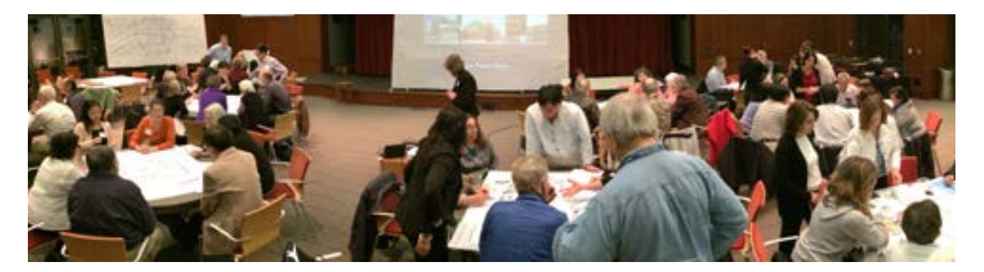
The Cupertino community was integral to the formation of A Vision for Cupertino through participation and input during numerous citywide workshops, meetings, hearings and online surveys