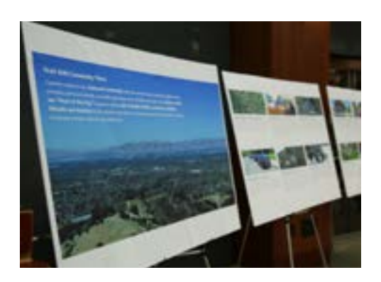
Each chapter of Community Vision 2040 directly implements the vision statement and Guiding Principles that were developed through an extensive community process